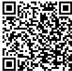
Digital Hymnal (Spotify)

A. Because he has saved us from our sins.